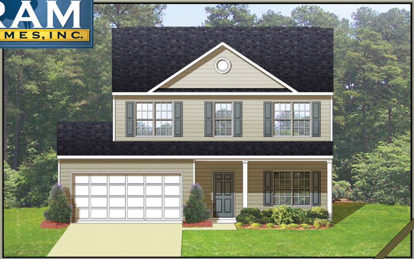
Elevation "B" Featured