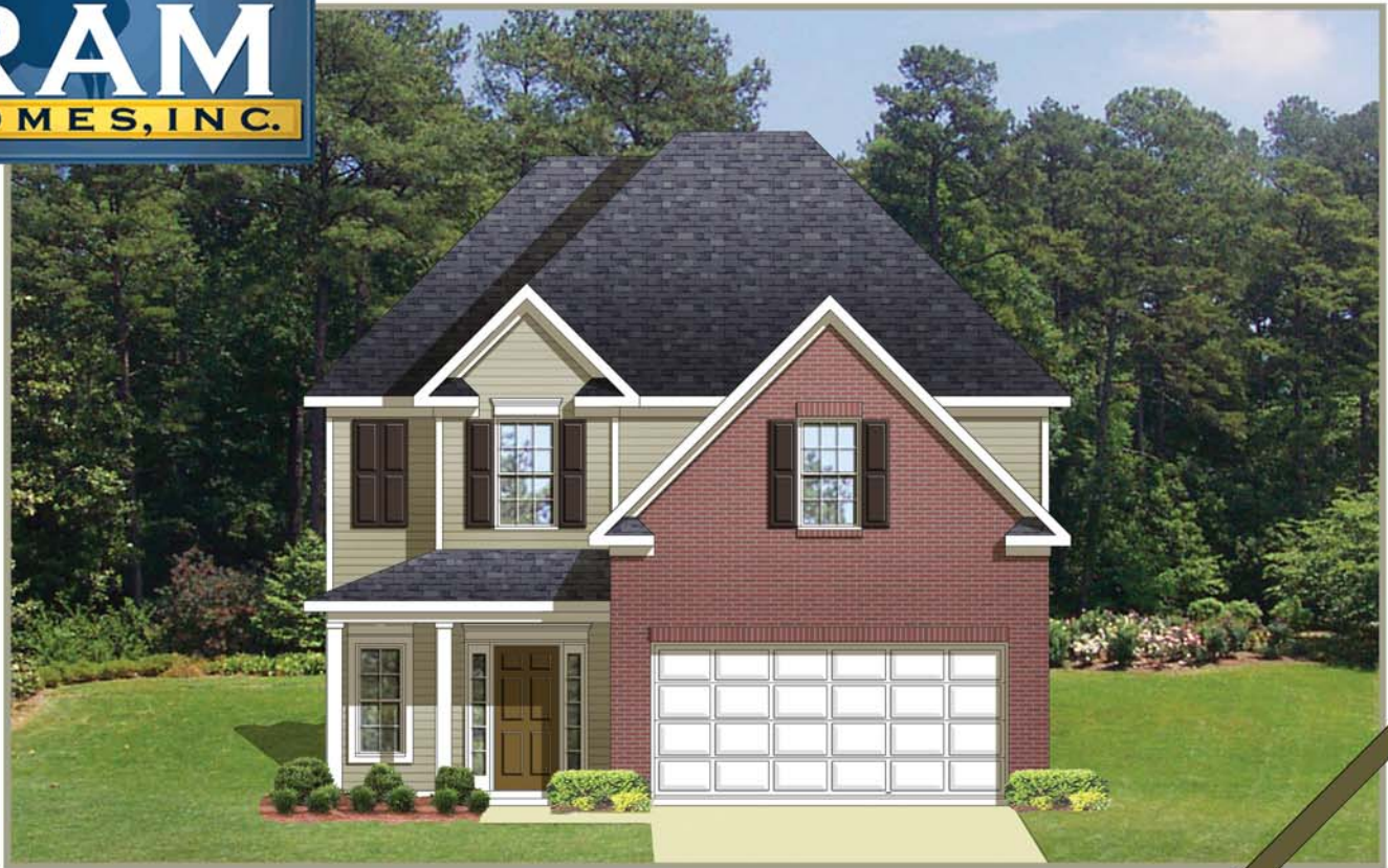
Elevation "B" Featured