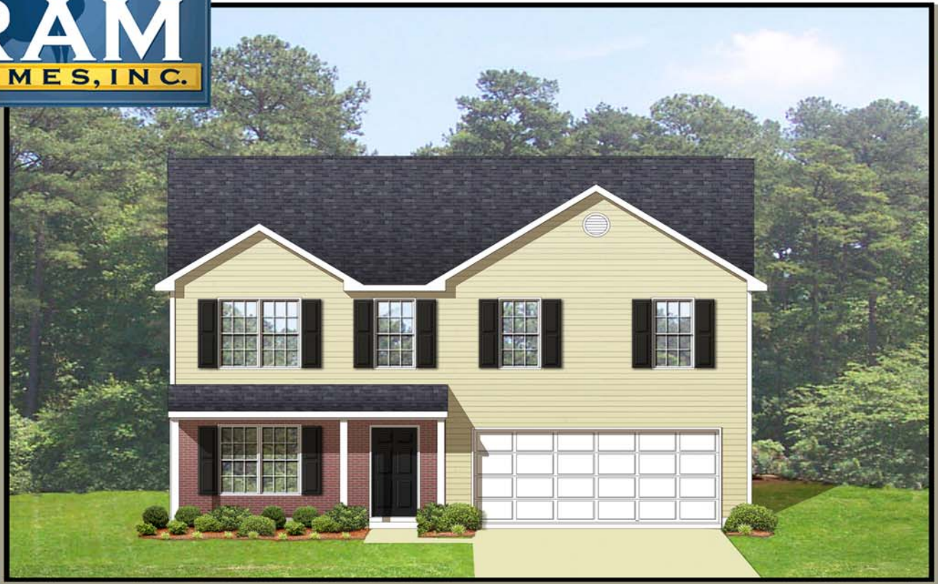
Elevation "B" Featured