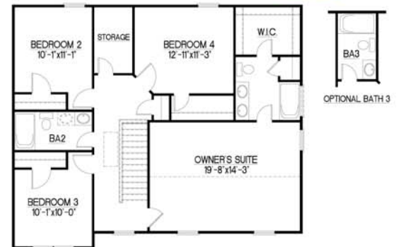
SECOND FLOOR W/ 2-CAR GARAGE